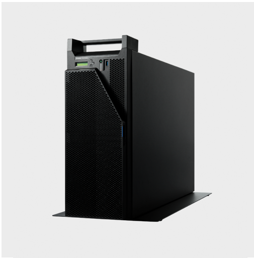
IBM Power S1014