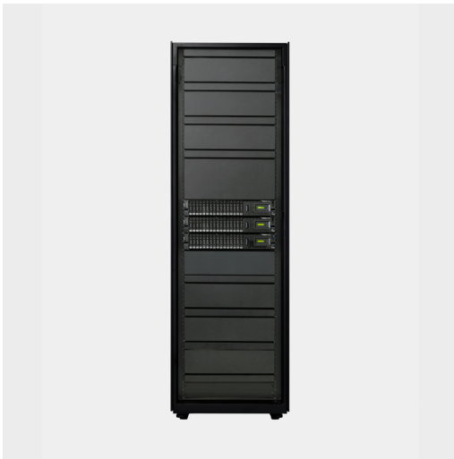
IBM Power S1022